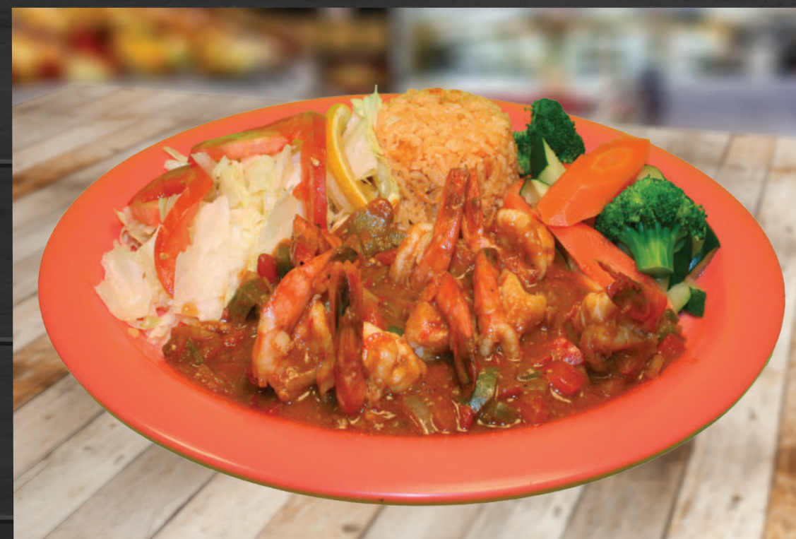
CAMARONES RANCHEROS Shrimp Cooked with Onions, Tomatoes, Bell Peppers, Jalapeños & Ranchero Sauce, served with Rice, Vegetable & Lettuce