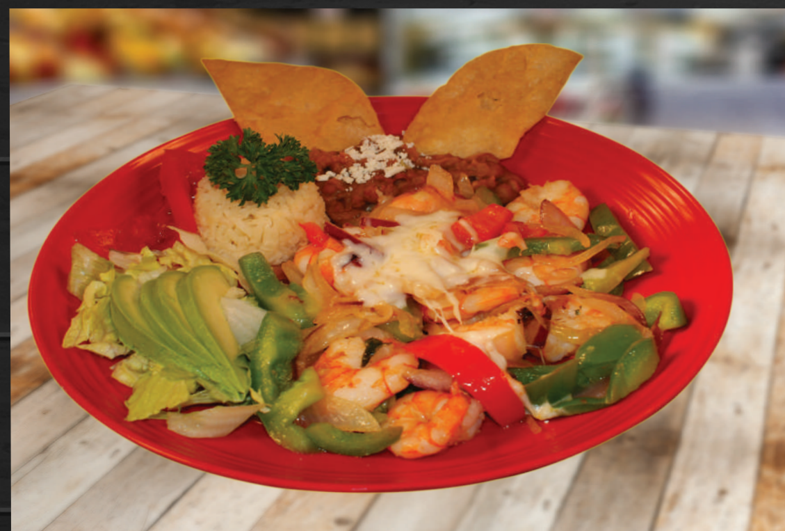
FAJITAS DE CAMARON Shrimp Fajitas with Rice, Beans, Guacamole & Lettuce