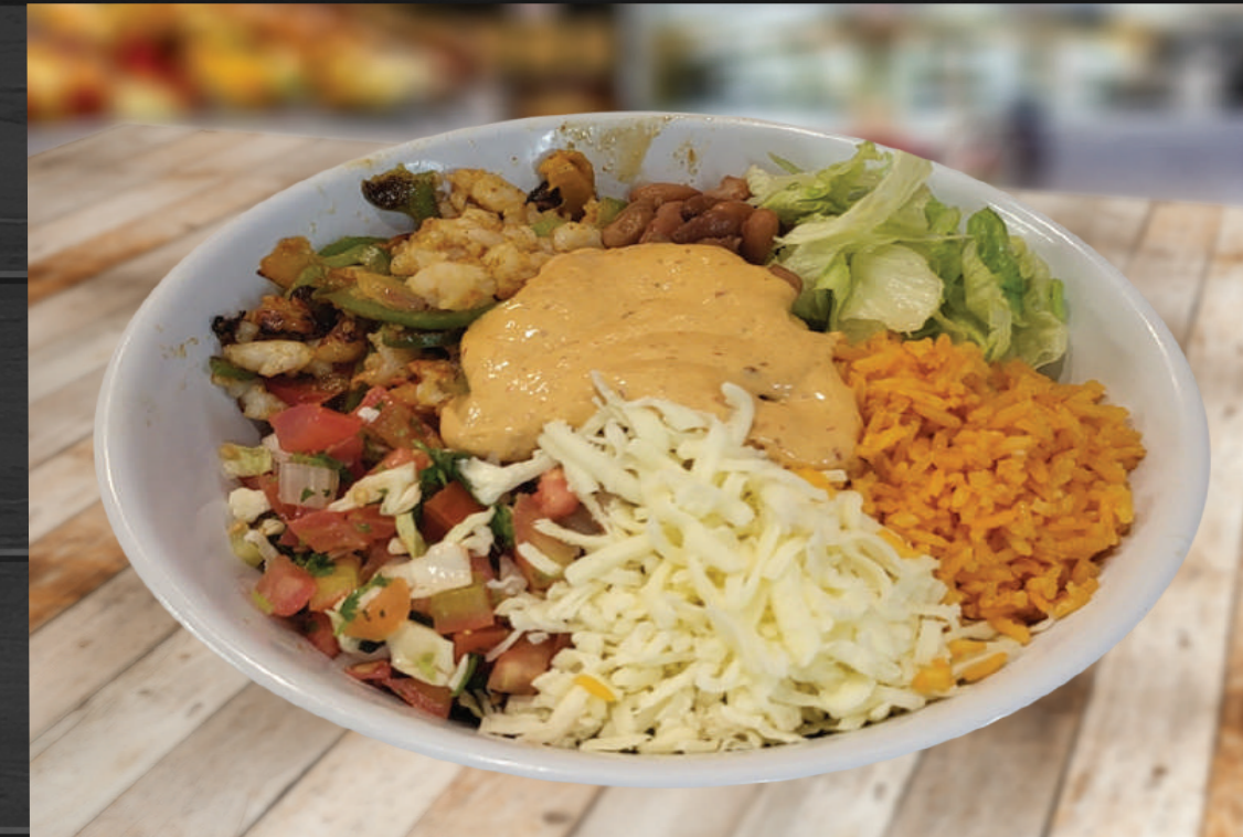
BOWL DE CAMARON O PESCADO