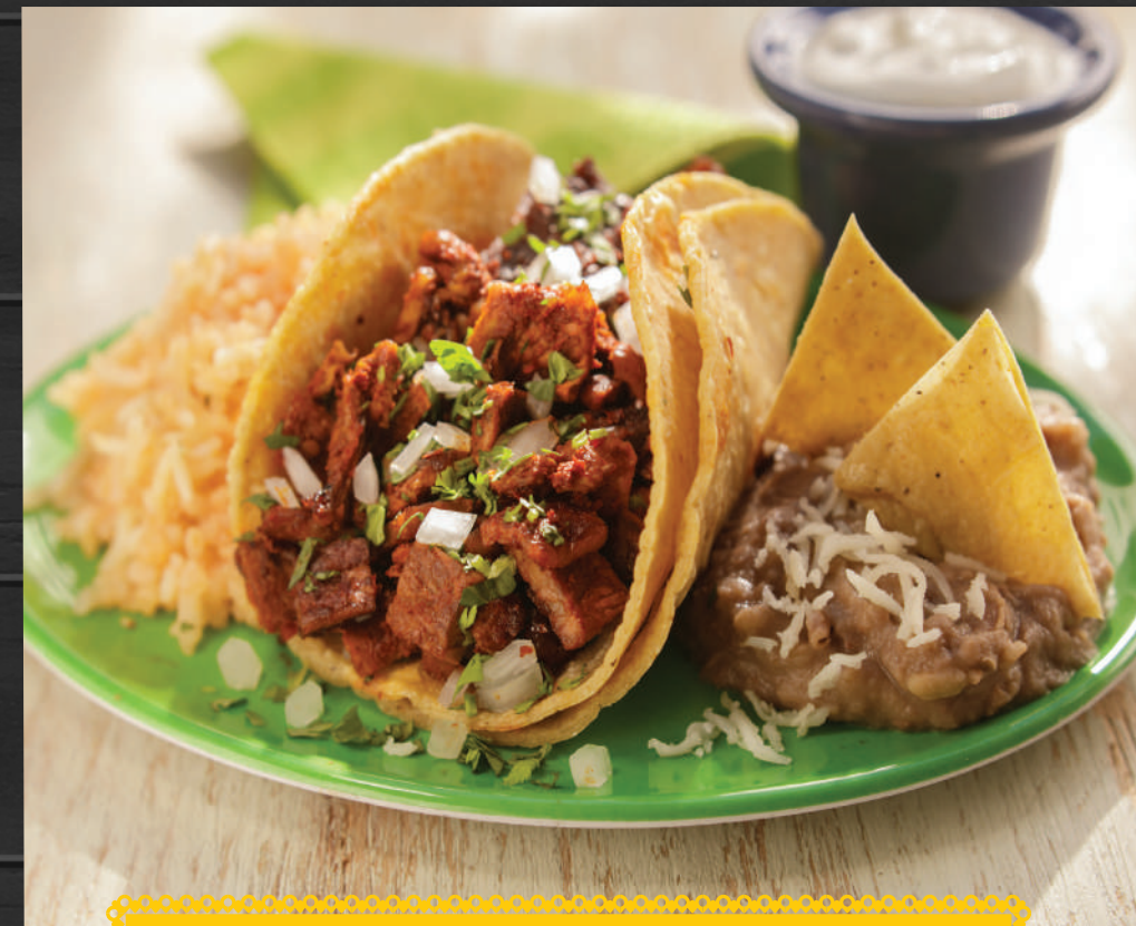
KIDS TACO PLATE