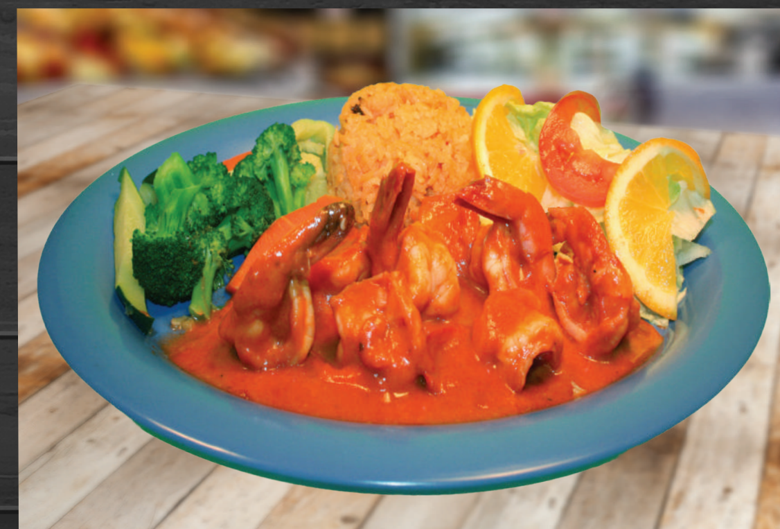
CAMARONES A LA DIABLA Spicy Shrimp cooked in a Hot Red Sauce, served with Rice, Vegetable, Tomatoes & Lettuce