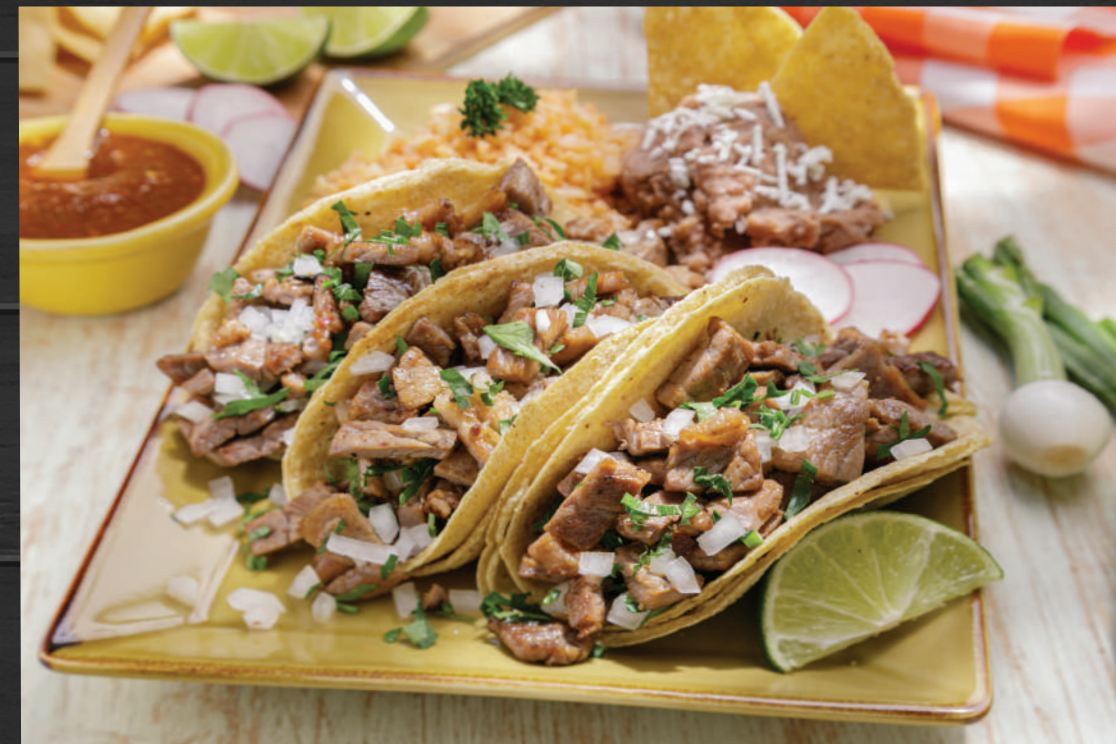
TACO PLATE Three Tacos served with Rice & Beans $11 99