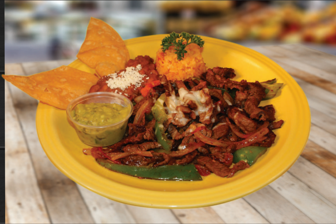
FAJITAS RES or POLLO Steak or Chicken Fajitas, served with Rice, Beans, Tomatoes, Guacamole & Letucce