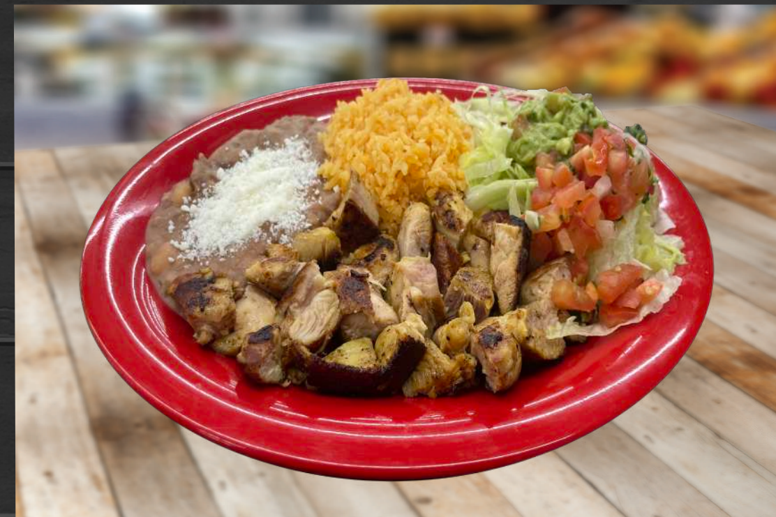
REGULAR PLATE Choice of Meat served with Rice, Beans, Tomatoes, Guacamole & Letucce