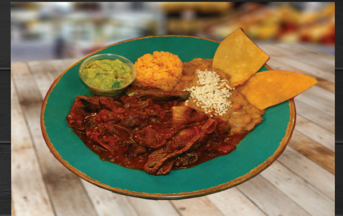
BISTEK RANCHERO Steak Cooked with Onions, Tomatoes, Bell Peppers, Jalapeños, and Ranchero Salsa with Rice Beans, Guacamole & Letucce