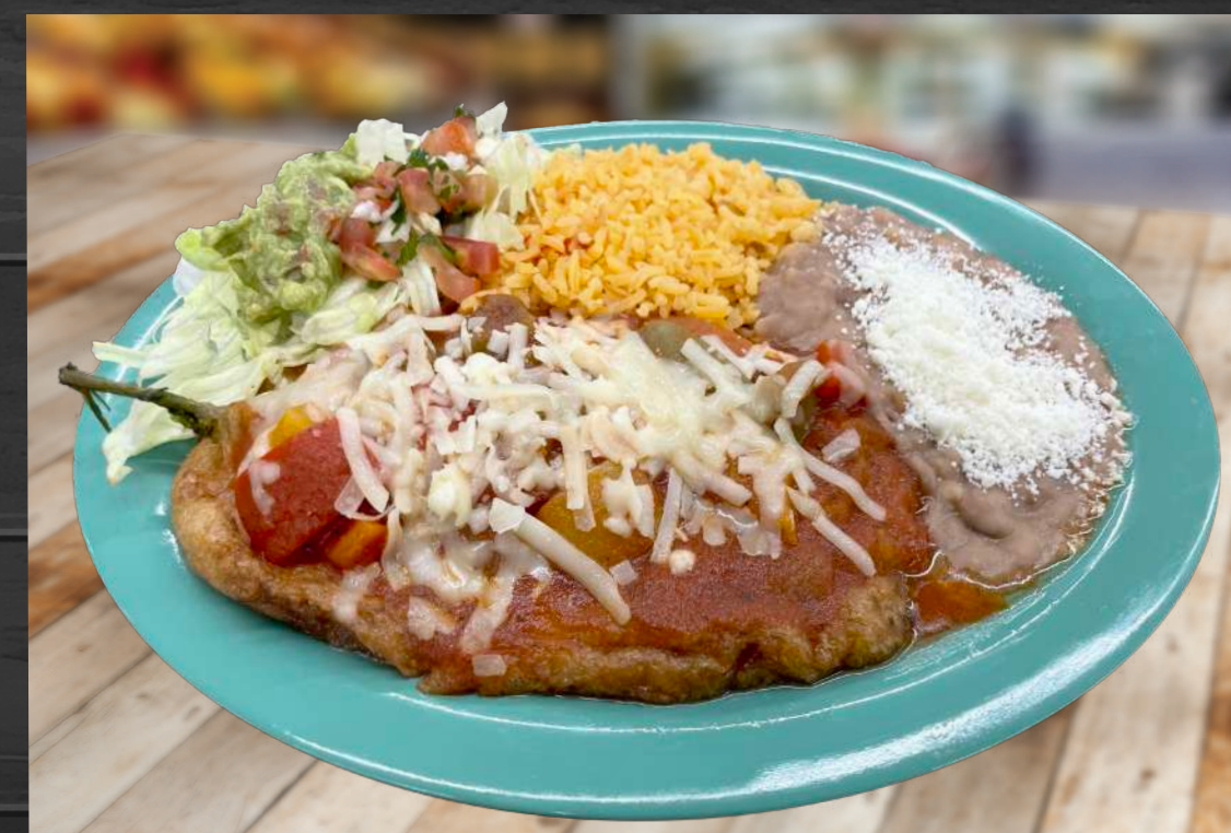
CHILE RELLENO $13 99 Chile Pasilla Pepper-stuffed with Cheese and drizzled with Mild Red Sauce. Served with Rice, Beans, Tomatoes & Lettuce.