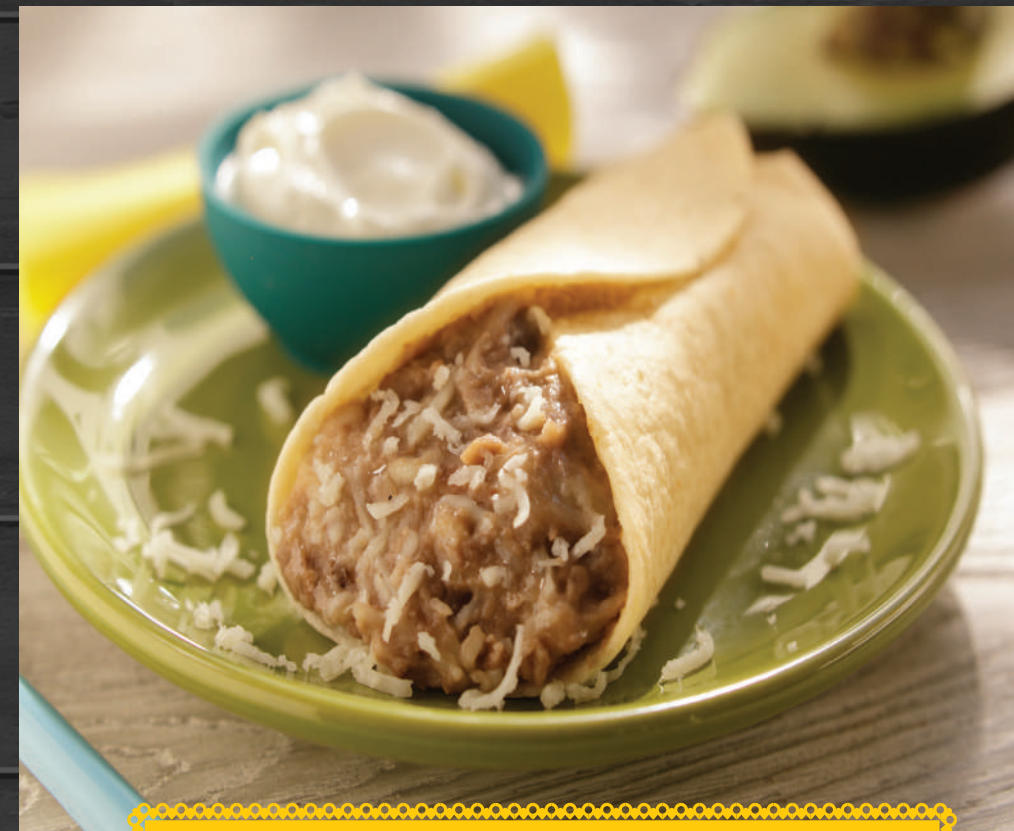
KIDS BEANS & CHEESE BURRITO