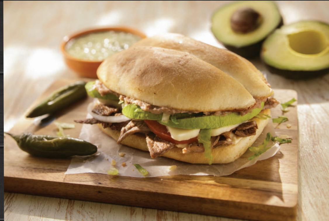
TORTAS $10 99 Choice of Meat, Beans, Tomatoes, Onions, Letucce, Avocado, Queso Fresco & Mayo