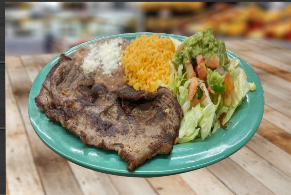
CARNE ASADA PLATE Carne Asada served with Rice, Beans, Tomatoes, Guacamole & Lettuce