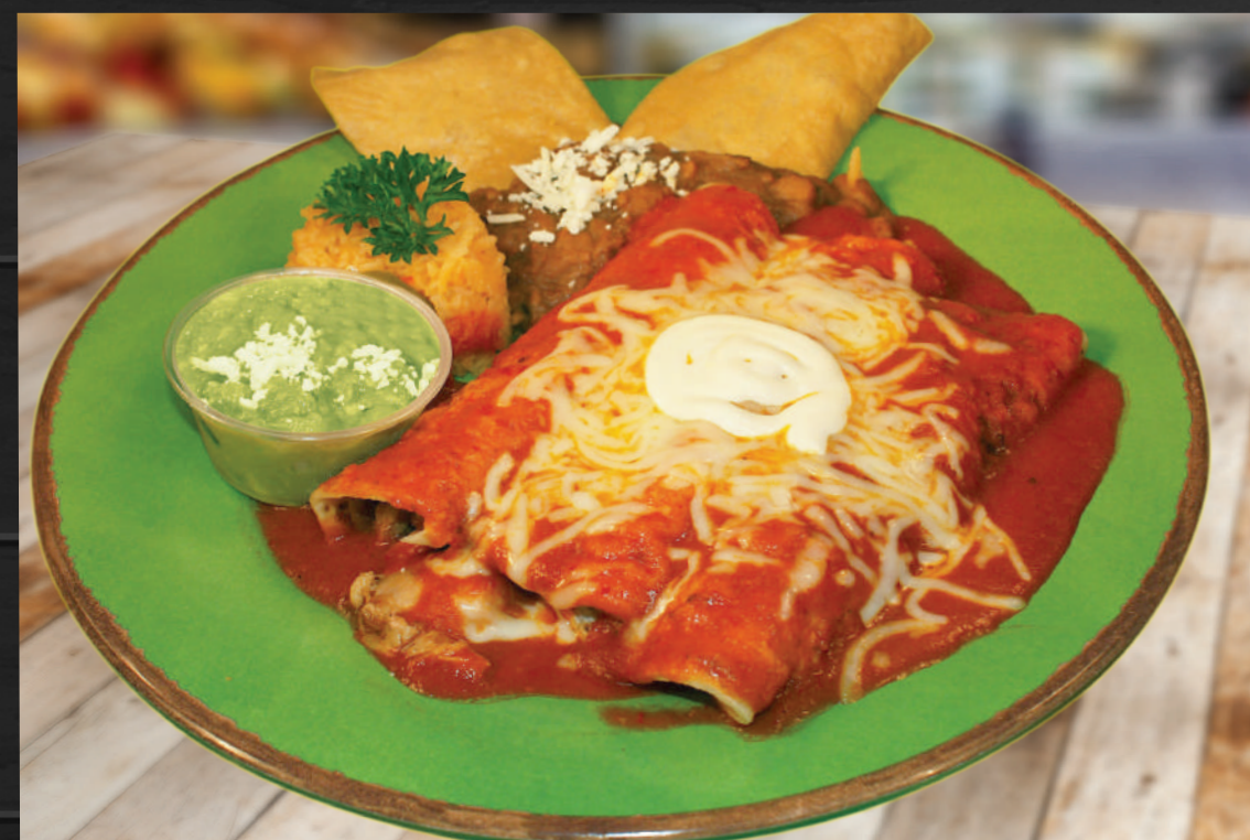
ENCHILADAS $13 99 3 Enchiladas, Beans, Rice, Tomatoes, Sour Cream, Guacamole & Lettuce.