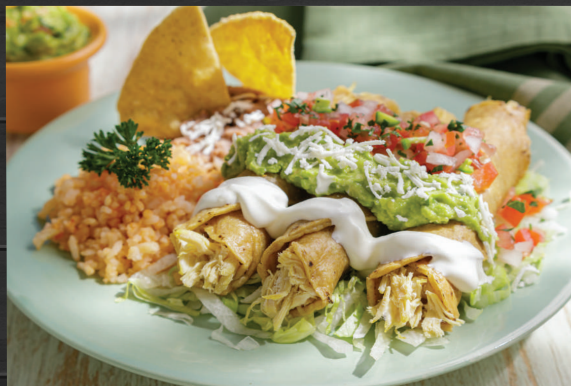
FLAUTAS $13 99 Chicken or Beef, deep fried Taquitos. Served with Rice, Beans, Guacamole, Pico de Gallo, Sour Cream, Cotija Cheese & Lettuce