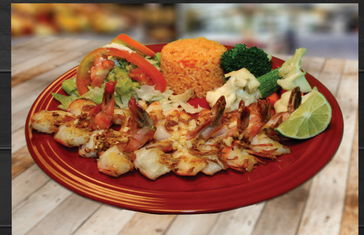
CAMARONES AL MOJO DE AJO Garlic Shrimp served with Rice, Vegetable, Tomatoes & Lettuce