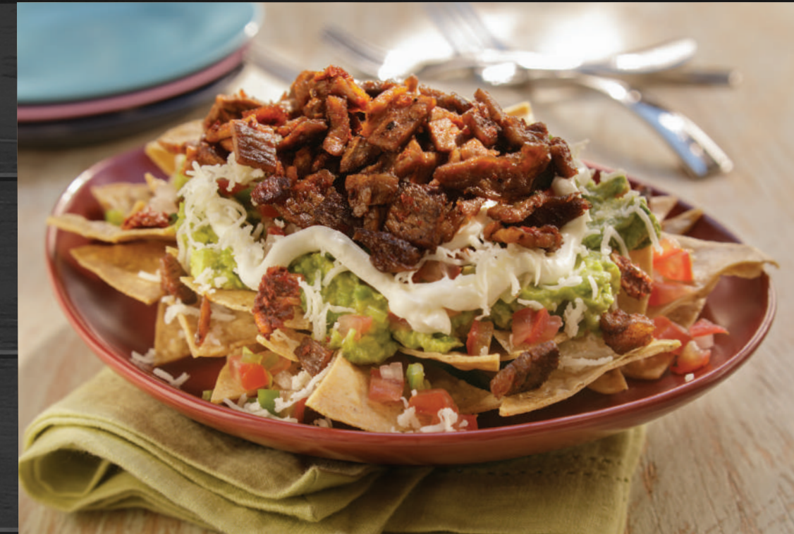
SUPER NACHOS $10 99 Chips topped with your choice of Meat, Beans, Sour Cream, Cheese, Tomatoes & Guacamole