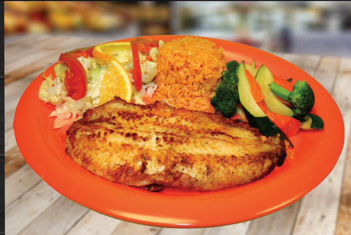
FILETE DE PESCADO Grilled Fillet of Fish, served with Rice, Vegetables, Onions & Lettuce