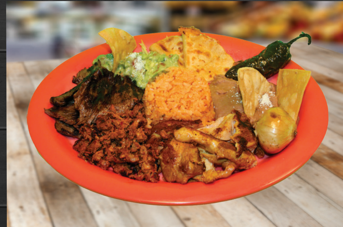
PARRILLADA Chorizo, Carne Asada, Pollo Asado, Quesadilla, Rice, Beans, Tomatoes & Guacamole