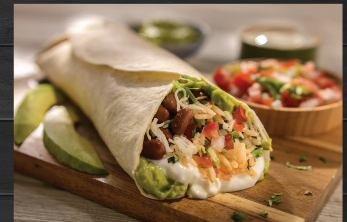
VEGETARIAN BURRITO $9 99 Rice, Beans, Lettuce, Pico de Gallo, Sour Cream, Cheese & Agüacate BEAN & CHEESE BURRITO $7 99 Burrito with Refried Beans & Cheese