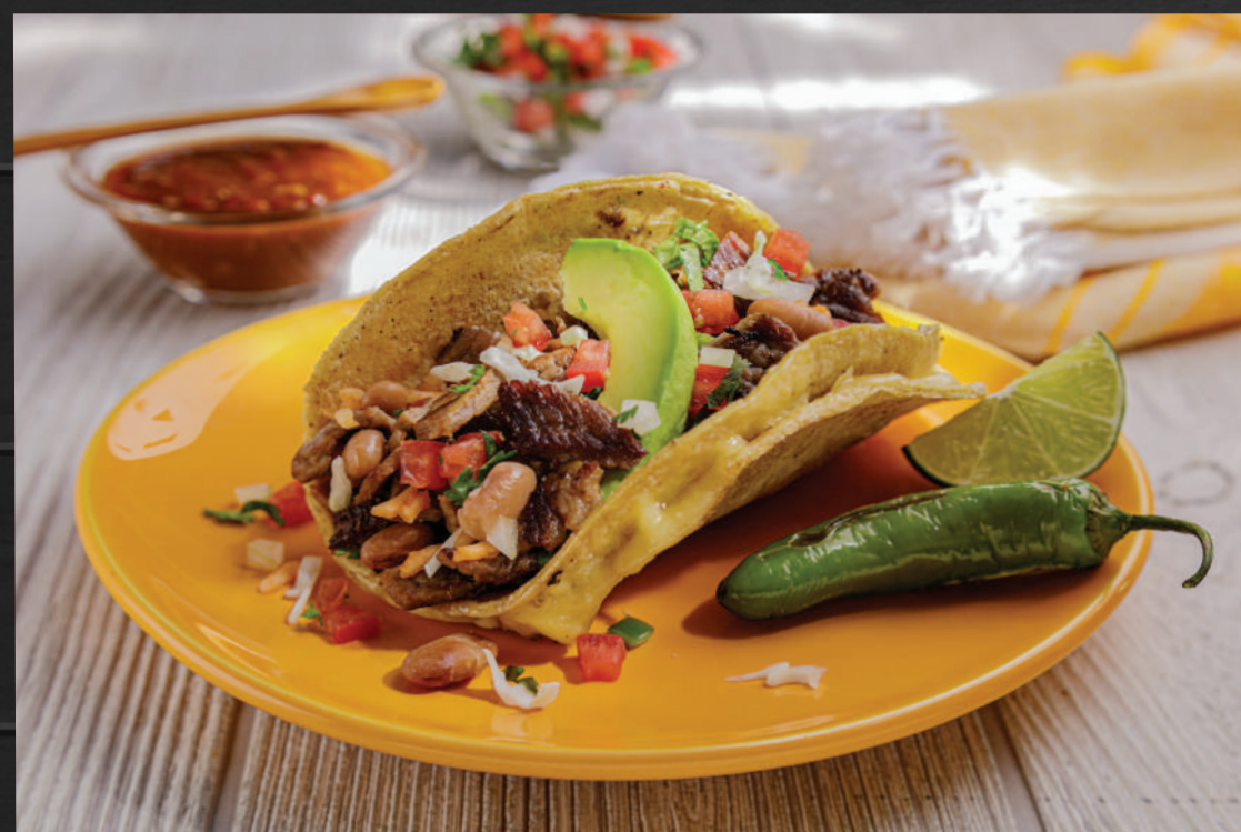
SUPER TACO $4 99 Choice of Meat, Rice, Whole Beans, Cheese, Avocado & Pico de Gallo