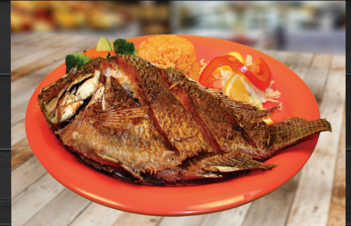
PESCADO FRITO Deep fried Talapia Fish, served with Rice, Vegetables, Tomatoes & Lettuce