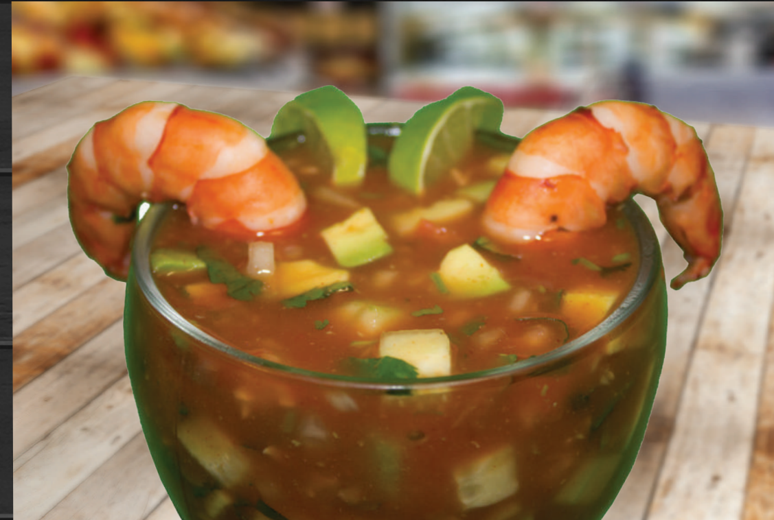
COCTEL DE CAMARON Shrimp Cocktail made with Onions, Tomatoes, Cilantro, Cucumber & Avocado