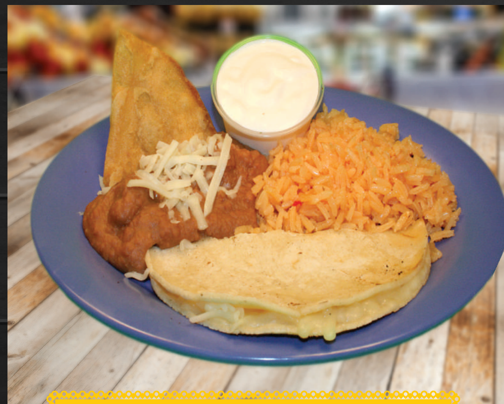
KIDS QUESADILLA PLATE