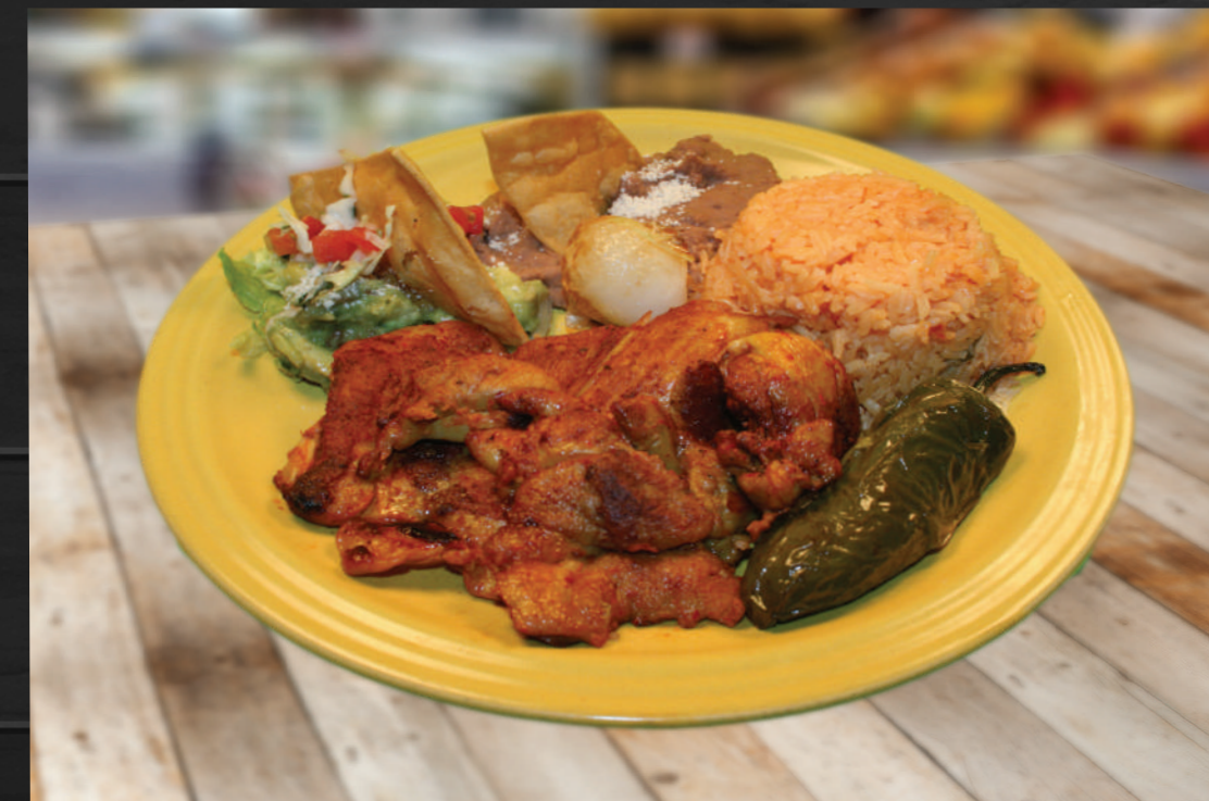
POLLO ASADO Grilled Boneless Chicken Thigh, Rice, Beans, Tomatoes, Guacamole & Letucce