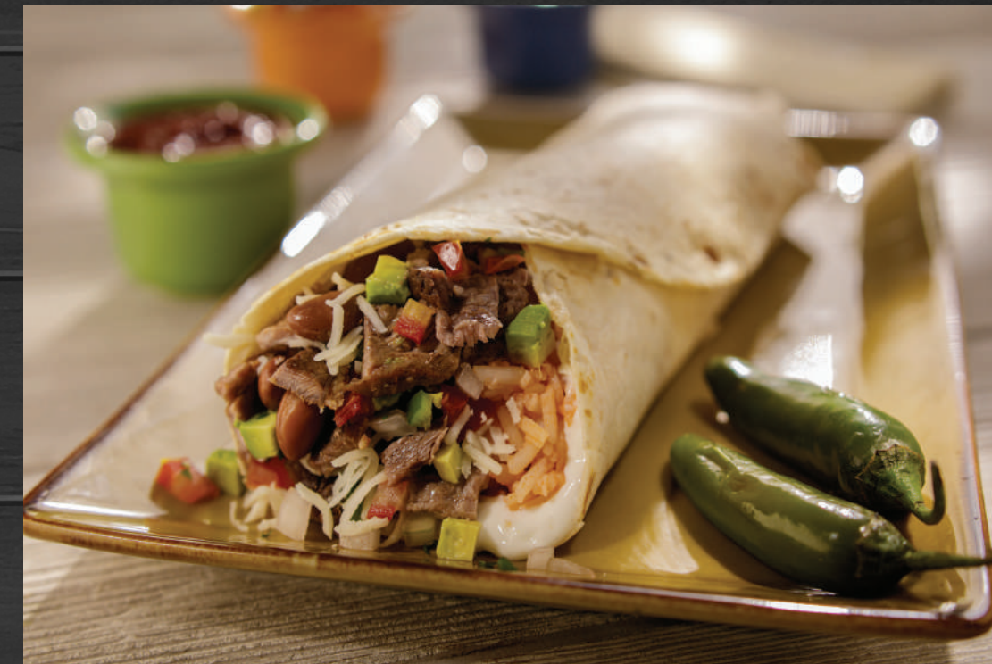
REGULAR BURRITO $9 99 Choice of Meat, Rice, Beans, Pico de Gallo & Sour Cream SUPER BURRITO $10 99 Choice of Meat, Rice, Beans, Pico de Gallo, Sour Cream, Cheese & Avocado