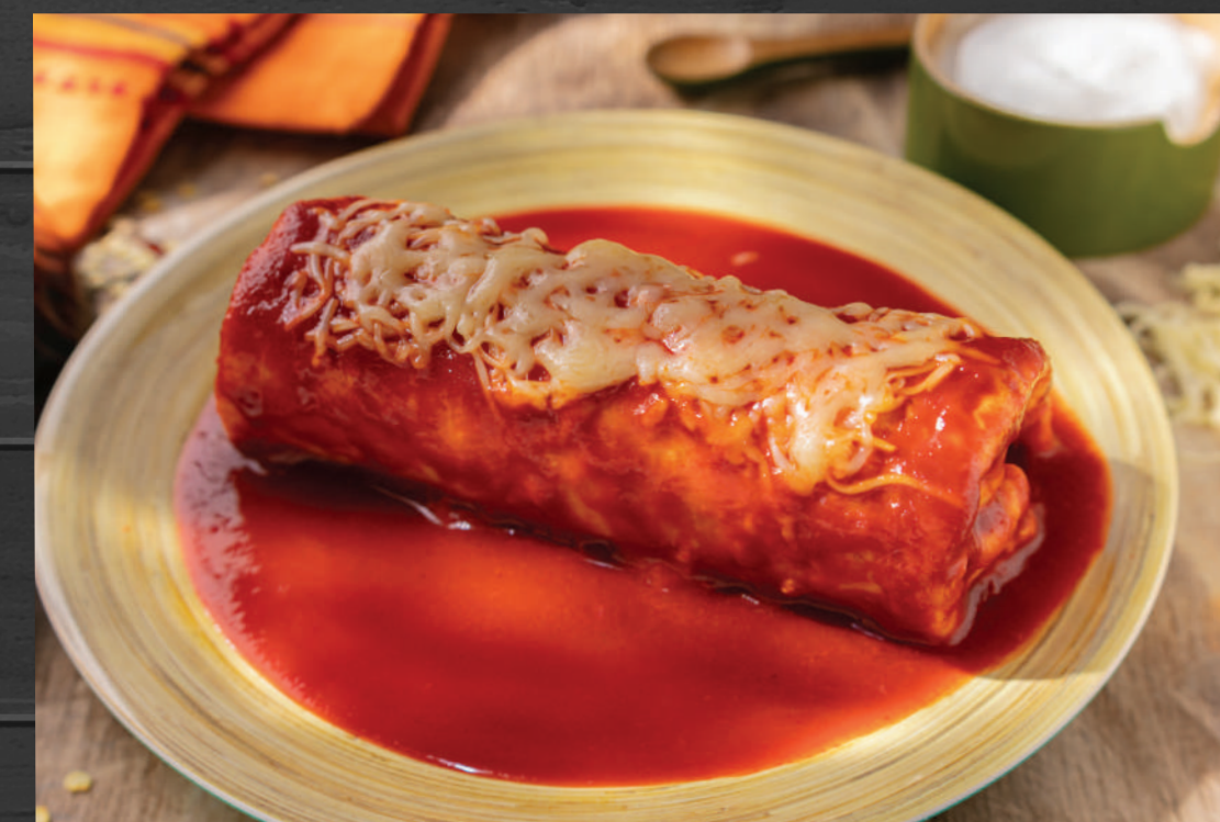
BURRITO MOJADO $11 99 Super Burrito topped with Enchilada Sauce and Melted Cheese, served with Sour Cream, Rice, Beans, Avocado & Pico de Gallo