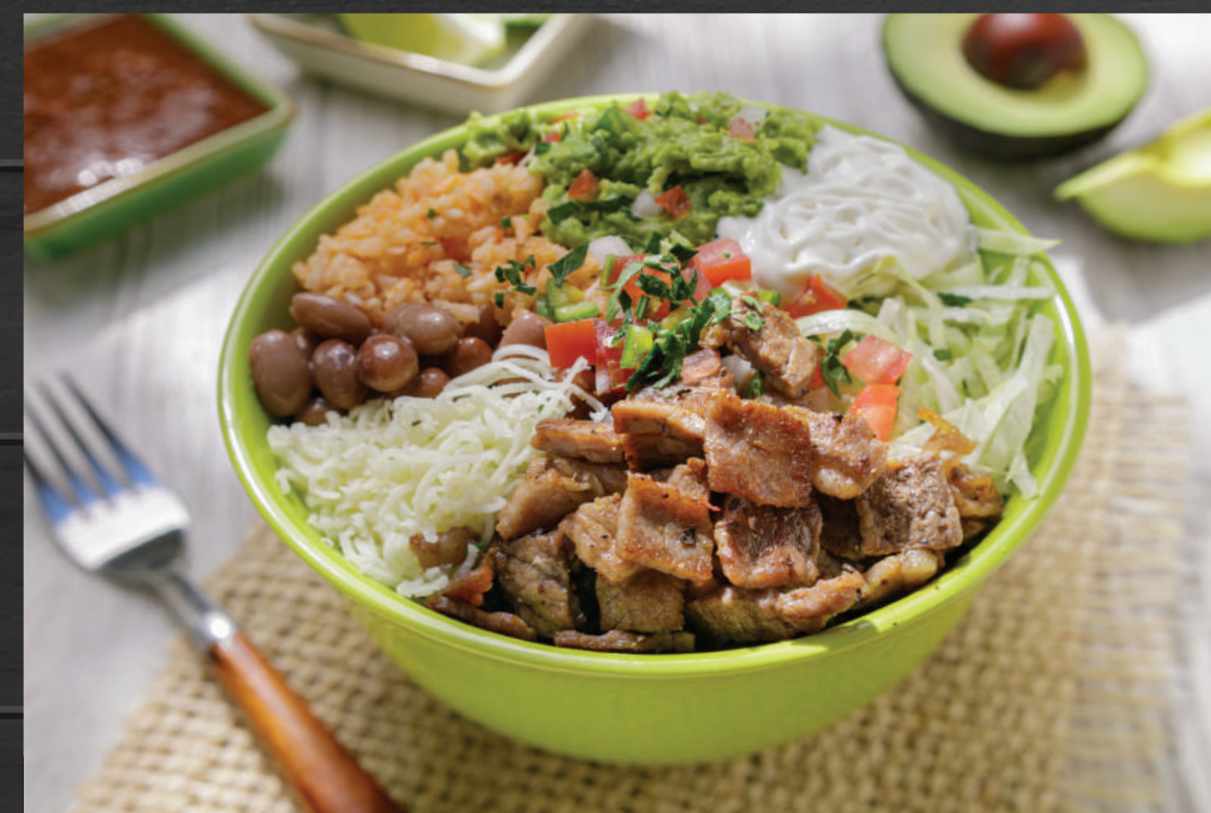
BURRITO BOWL $10 99 Choice of Meat, Rice, Beans, Pico de Gallo, Lettuce, Sour Cream, Cheese & Guacamole