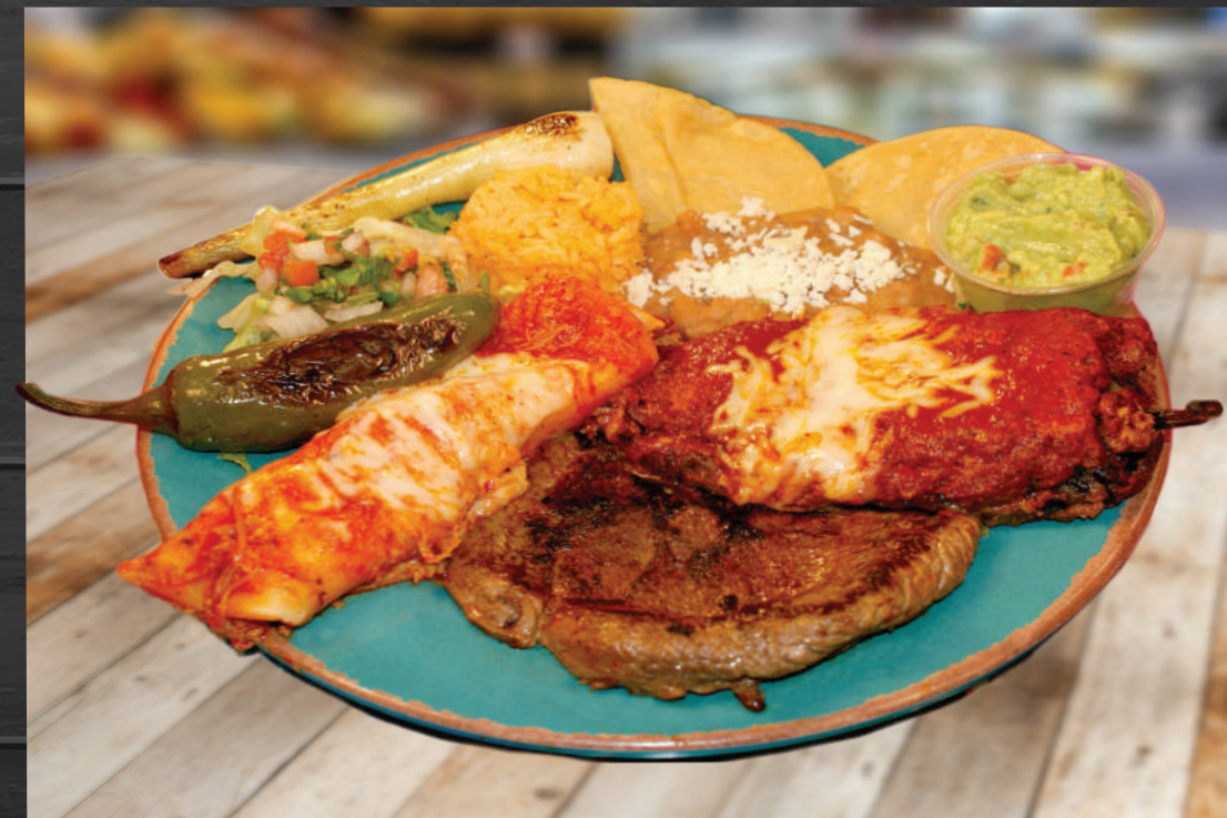
PLATO MEXICANO Chile Relleno, Enchilada & Carne Asada combination, served with Rice, Beans, Tomatoes, Guacamole & Lettuce