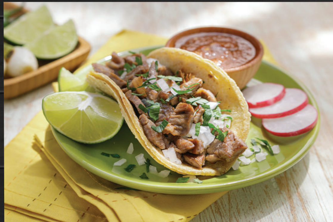
TACO Choice of Meat, Onions & Cilantro $2 69