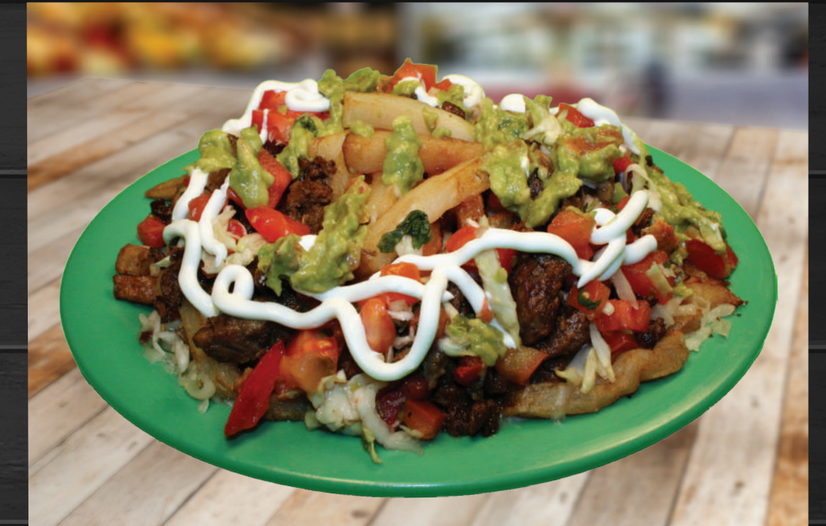
CARNE ASADA FRIES $10 99 French Fries topped with Choice of Meat, Pico de Gallo, Guacamole, Cheese & Sour Cream