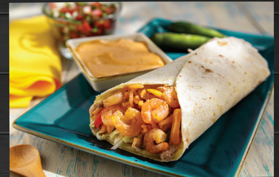
BURRITO DEL MAR $12 99 Shrimp or Fish, Grilled Onions, Bell Peppers, Cabbage, Rice, Beans, Pico de Gallo & Chipotle Sauce