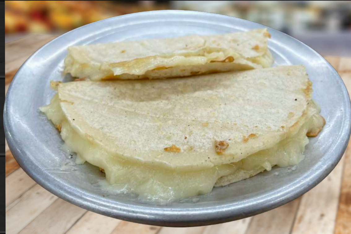
QUESADILLA $8 99 Flour Tortilla with Cheese, Sour Cream & Pico de Gallo