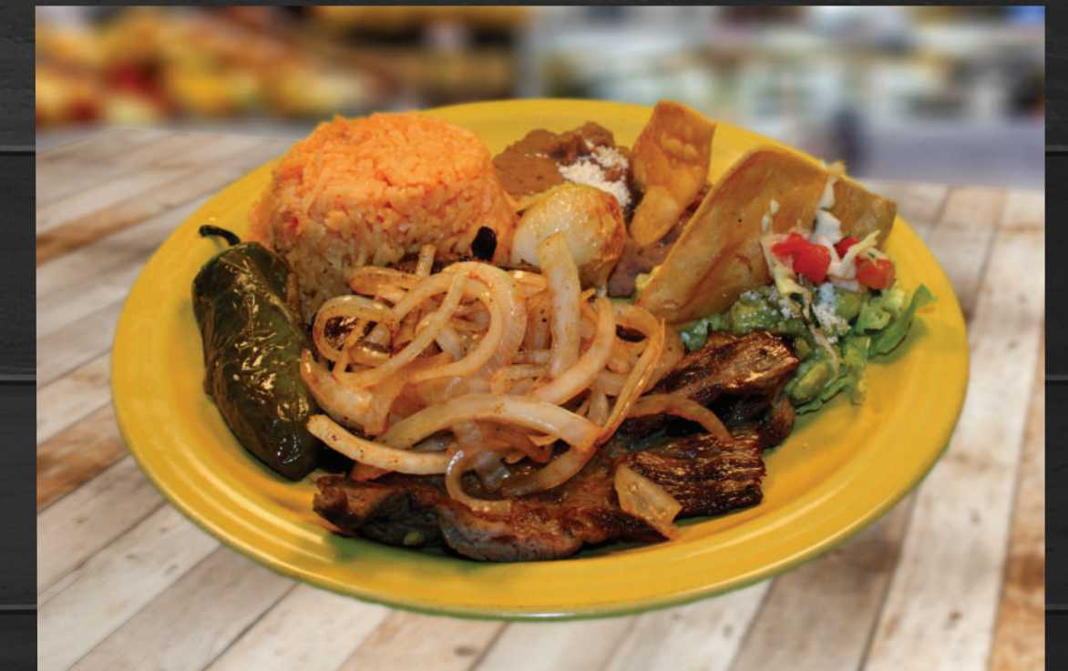
BISTEK ENCEBOLLADO Sauced Steak with Grilled Onions, with Rice, Beans, Tomatoes, Guacamole & Letucce