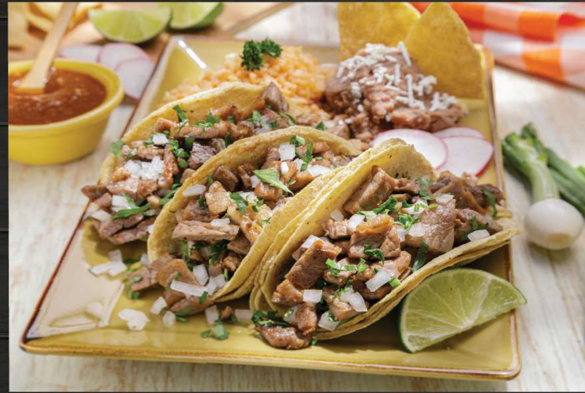
TACO PLATE Three Tacos served with Rice & Beans $11 99