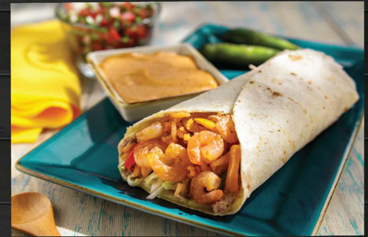
BURRITO DEL MAR $12 99 Shrimp or Fish, Grilled Onions, Bell Peppers, Cabbage, Rice, Beans, Pico de Gallo & Chipotle Sauce