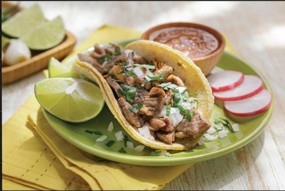
TACO Choice of Meat, Onions & Cilantro $2 69