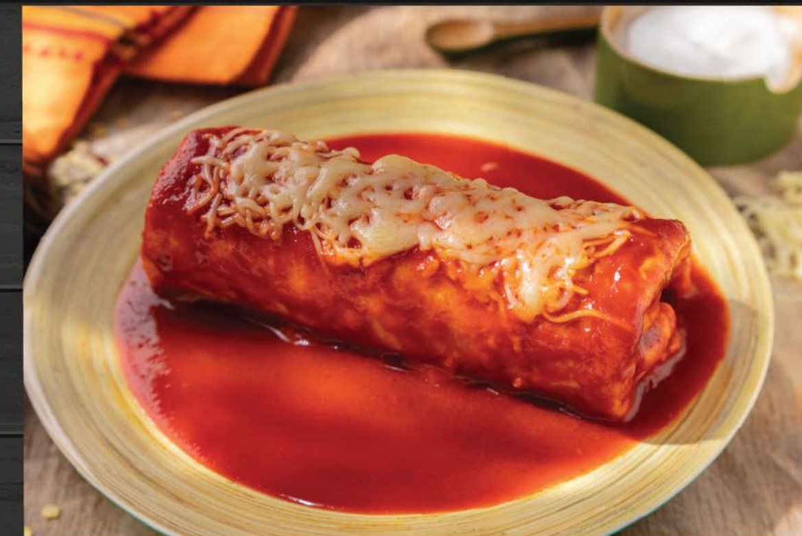
BURRITO MOJADO $11 99 Super Burrito topped with Enchilada Sauce and Melted Cheese