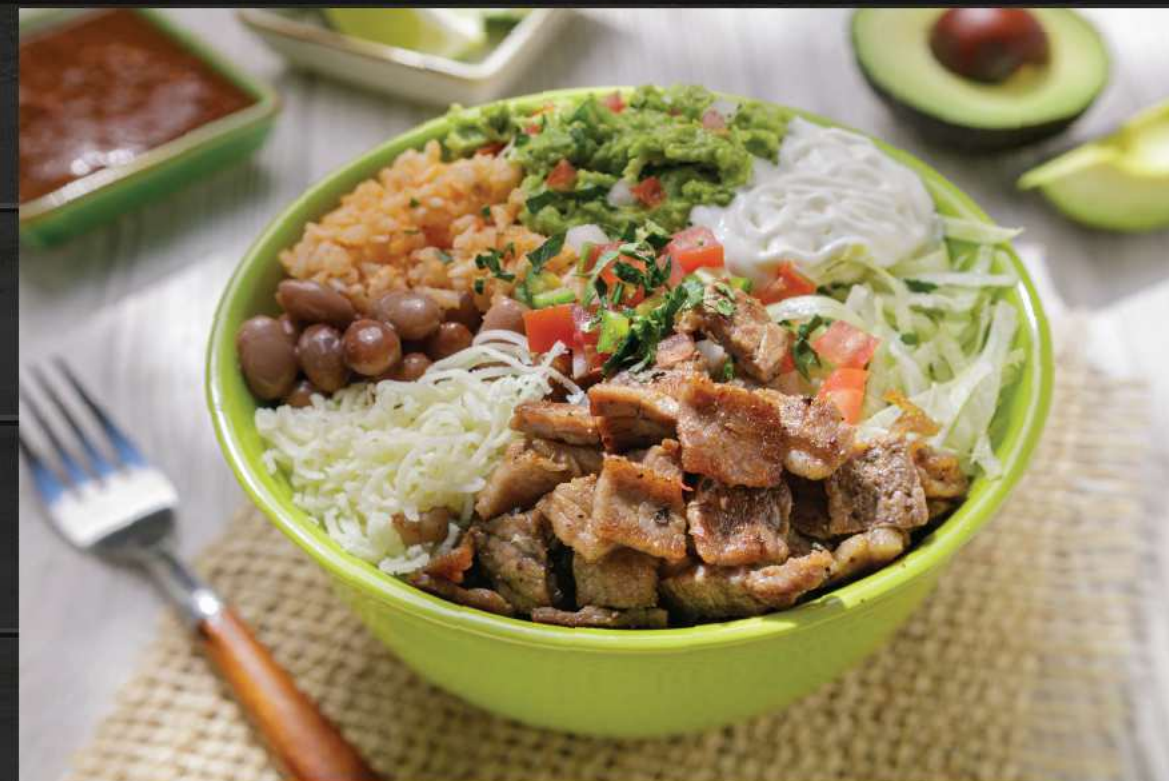
BURRITO BOWL $10 99 Choice of Meat, Rice, Beans, Pico de Gallo, Lettuce, Sour Cream, Cheese & Guacamole