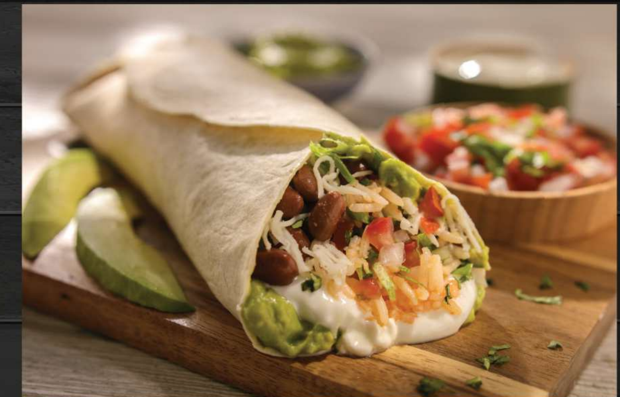
VEGETARIAN BURRITO $9 99 Rice, Beans, Lettuce, Pico de Gallo, Sour Cream, Cheese & Agüacate BEAN & CHEESE BURRITO $7 99 Burrito with Refried Beans & Cheese