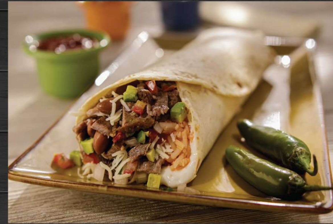
REGULAR BURRITO $9 99 Choice of Meat, Rice, Beans, Pico de Gallo & Sour Cream SUPER BURRITO $10 99 Choice of Meat, Rice, Beans, Pico de Gallo, Sour Cream, Cheese & Avocado