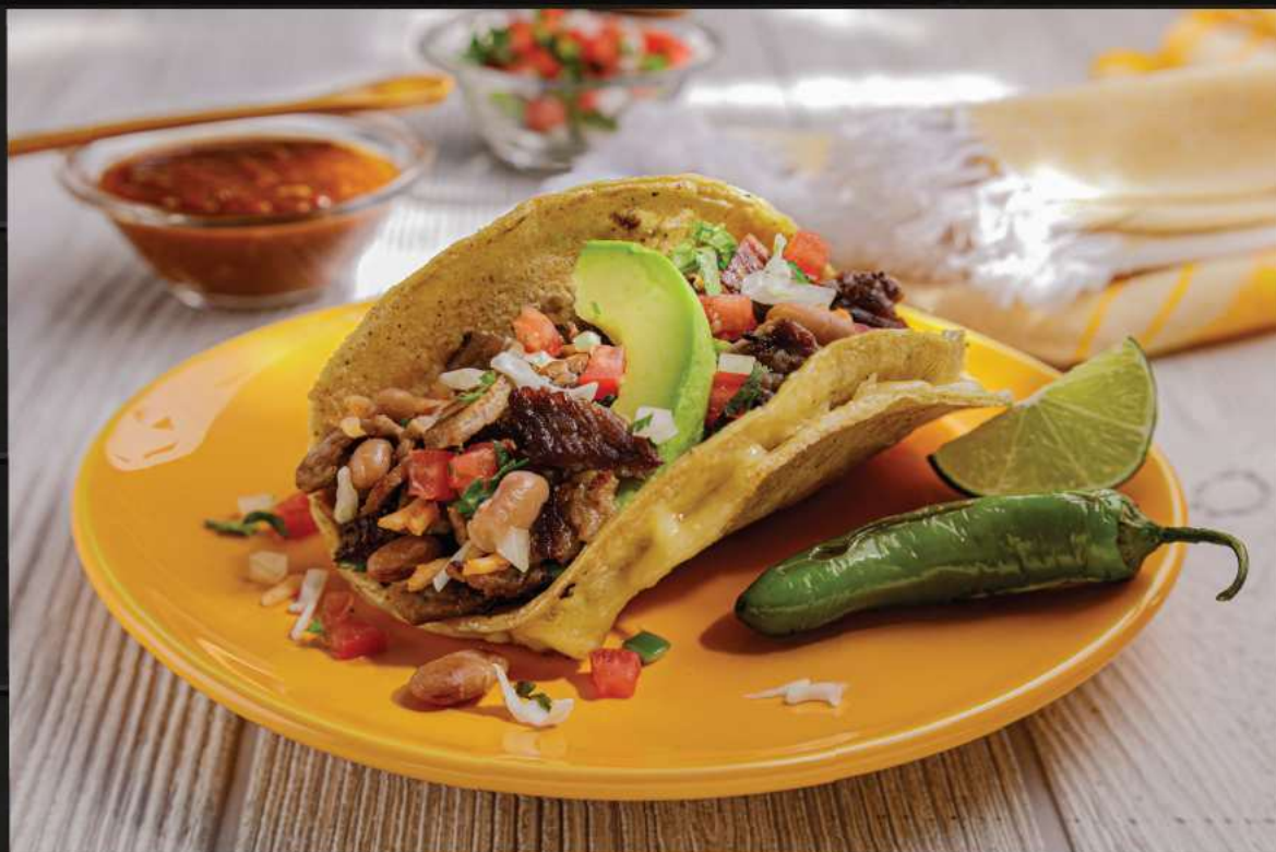
SUPER TACO $4 99 Choice of Meat, Rice, Whole Beans, Cheese, Avocado & Pico de Gallo