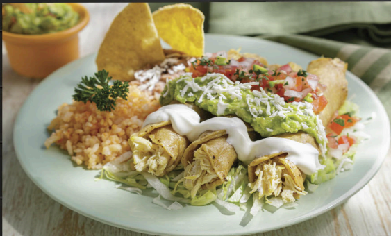
FLAUTAS Chicken or Beef, deep fried Taquitos. Served with Rice, Beans, Guacamole, Pico de Gallo, Sour Cream, Cotija Cheese & Lettuce