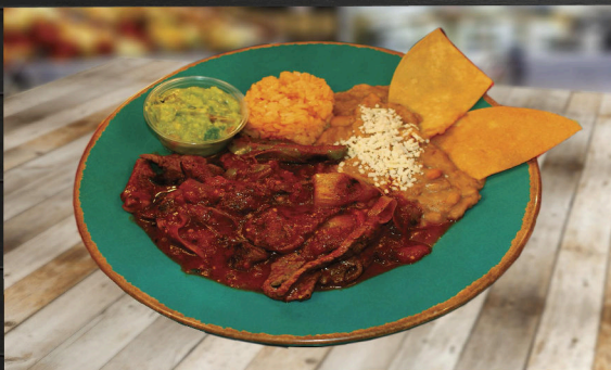
BISTEK RANCHERO Steak Cooked with Onions, Tomatoes, Bell Peppers, Jalapeños, and Ranchero Salsa with Rice Beans, Guacamole & Lettuce