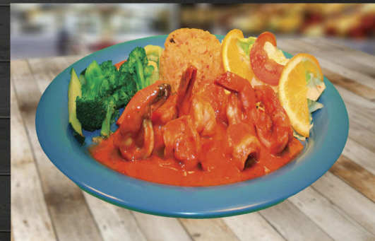
CAMARONES A LA DIABLA or CAMARONES RANCHEROS or CAMARONES AL MOJO DE AJO