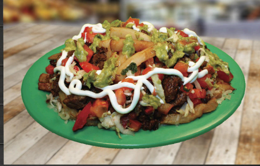
CARNE ASADA FRIES French Fries topped with Choice of Meat, Pico de Gallo, Guacamole, Cheese & Sour Cream