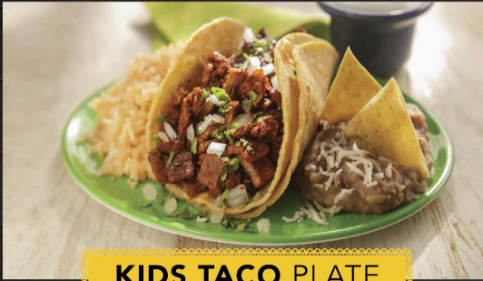
KIDS TACO PLATE