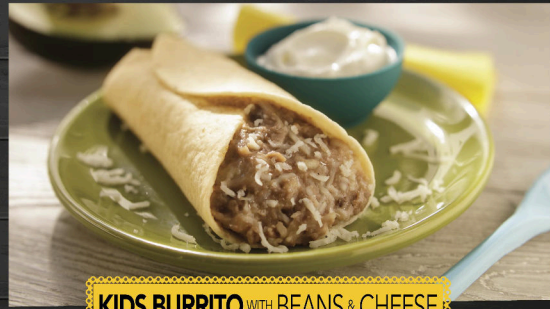
KIDS BURRITO WITH BEANS & CHEESE