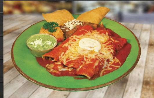
ENCHILADAS 3 Enchiladas, Beans, Rice, Tomatoes, Sour Cream, Guacamole & Lettuce.