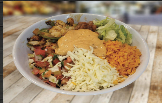
BOWL DE CAMARON O PESCADO