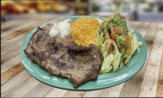
CARNE ASADA PLATE Carne Asada served with Rice, Beans, Tomatoes, Guacamole & Lettuce