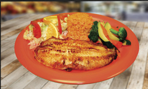
FILETE DE PESCADO Grilled Fillet of Fish, served with Rice, Vegetables, Onions & Lettuce