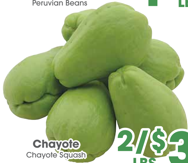
Chayote Chayote Squash