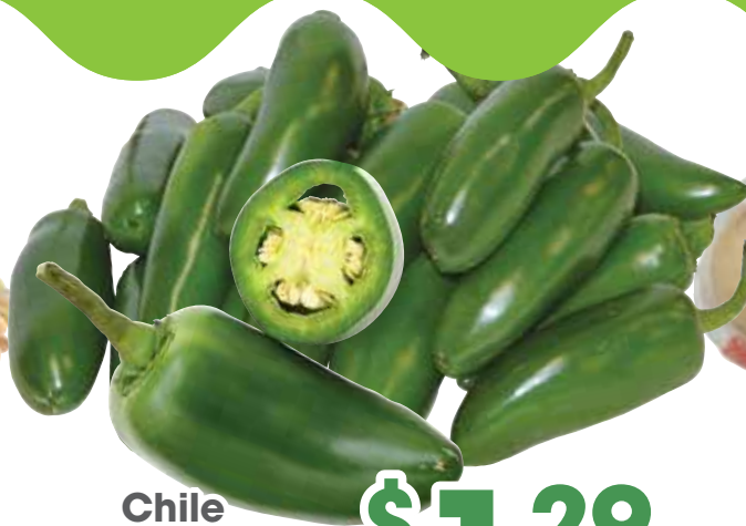
Chile Jalapeño Jalapeño Peppers