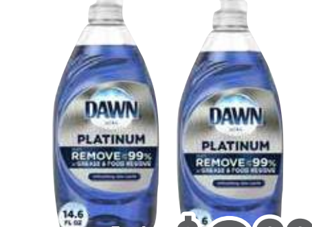
Jabon para Trastes Dawn Platinum Ultra Dish Soap 12.2-14.7 oz.