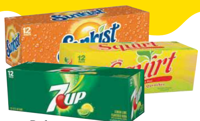
Refrescos 7 Up

Soft Drinks, Selected Varieties 12 Pack, 12 oz. Cans