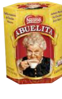
Chocolate Abuelita Chocolate Tablets 19 oz.