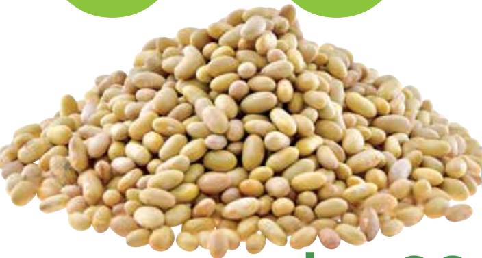
Frijol Peruano Peruvian Beans