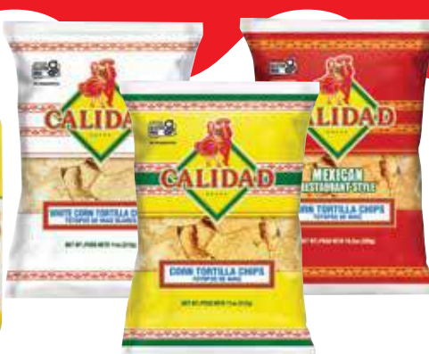
Totopos de Maiz Calidad Restaurant Style, Chile y Limon, Yellow or White Corn Tortilla Chips 10.5-11 oz.