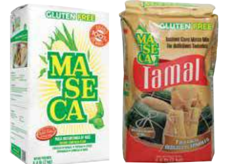
Harina de Maiz o Tamal Maseca Corn Masa Mix 4 Lbs.