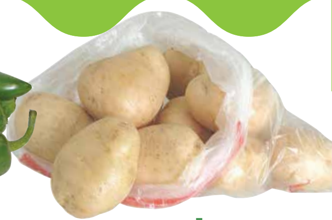
Papas Blanca Bolsa de 5 Lbs. White Potatoes, 5 Lb. Bag