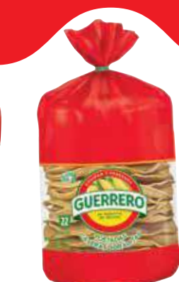
Tostadas Guerrero Casera or Classica Amarilla 12.8 oz.