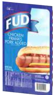
Salchichas FUD Selected Varieties Franks, 2.5 Lbs.