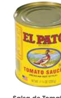
Salsa de Tomate El Pato Selected Varieties Hot Tomato Sauce, 7.75 oz.