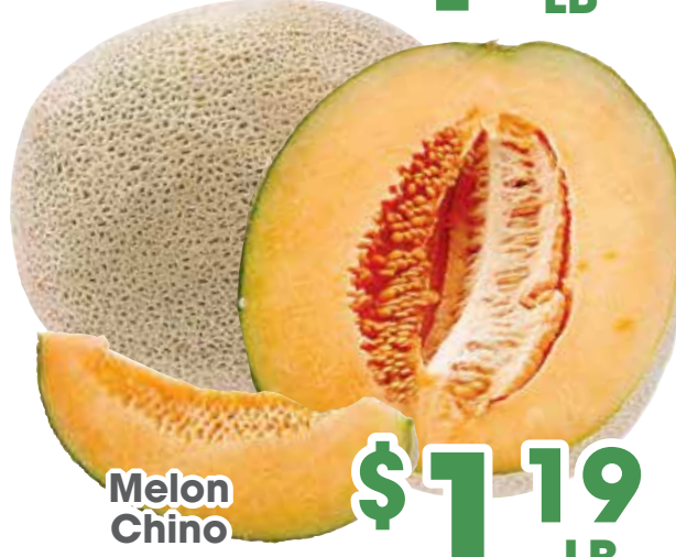
Melon Chino Cantaloupe