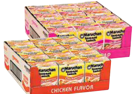
Sopas Maruchan Selected Varieties 12 Pack