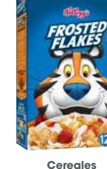
Cereales Frosted Flakes Kelloggs Selected Varieties, 12 oz.