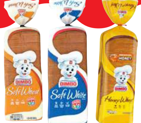
Pan para Sandwiches Bimbo Soft White, Honey Wheat or Soft Wheat Sandwich Bread, 20 oz.