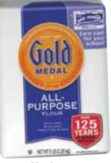
Harina Gold Medal All Purpose Flour 5 Lbs.