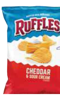
Botanas Doritos o Ruffles Selected Varieties Chips, 8-10.75 oz.