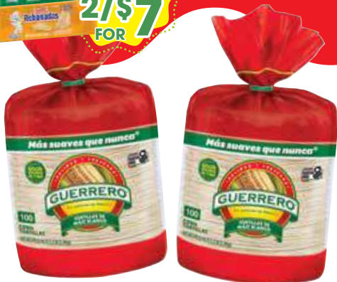
Tortillas de Maiz Guerrero White Corn Tortillas, 100 ct.

MultiPack Bimbo Pastries Mantecadas, Pananadas o Donitas Azucaradas 10.10.11.04.05 2/$7 FOR