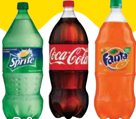
Refrescos Coca Cola