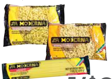
Pastas La Moderna Selected Varieties Pasta, 7 oz.