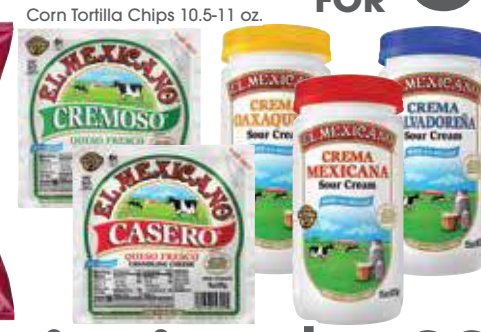
Quesos o Cremas El Mexicano Fresco, Cremoso Cheese, 10 oz. Sour Creams, 15 oz.