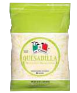
Queso para Quesadilla La Chona Shredded Cheese 16 oz.