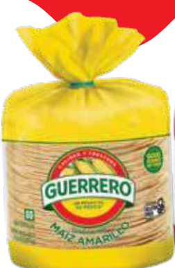
Tortillas de Maiz Blancas o Amarillas Guerrero White or Yellow Corn Tortillas 80 ct.