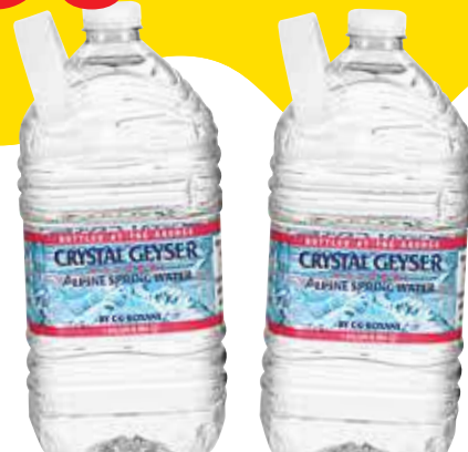
Agua Crystal Geyser Drinking Water 1 Gallon