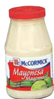
Mayonesa McCormick Mayonnaise, 28 oz.