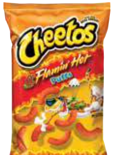
Botanas Cheetos o Fritos Selected Varieties 8-10 oz.