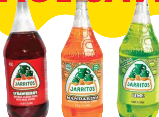
Refrescos Jarritos Soft Drinks, Selected Varieties 1.5 Liter