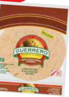
Tostadas Guerrero CasaR, Classica Amarilla Corn Tostadas 12.8 oz.