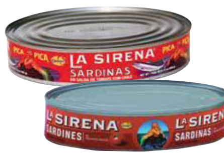
Sardina La Sirena Sardines, In Tomato Sauce or Spicy, 15 oz.