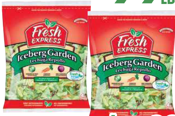
Ensalada Fresh Express Garden Salad, 10 oz.