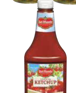
Ketchup Del Monte Tomato Ketchup 24 oz.