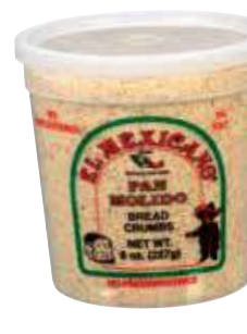
Pan Molido El Mexicano Bread Crumbs 8 oz.