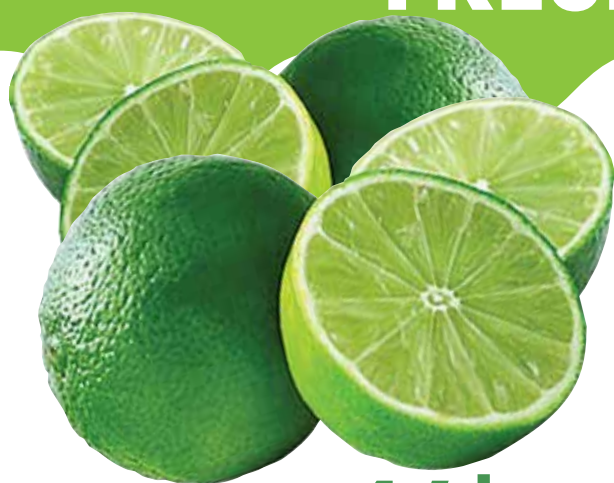
Limon Verde Green Limes