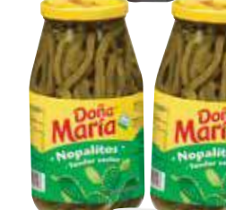
Nopalitos Doña Maria Tender Cactus, 30 oz.