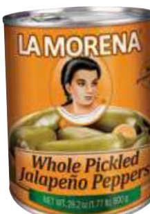
Jalapeños Enteros La Morena Whole Jalapeños 28 oz.