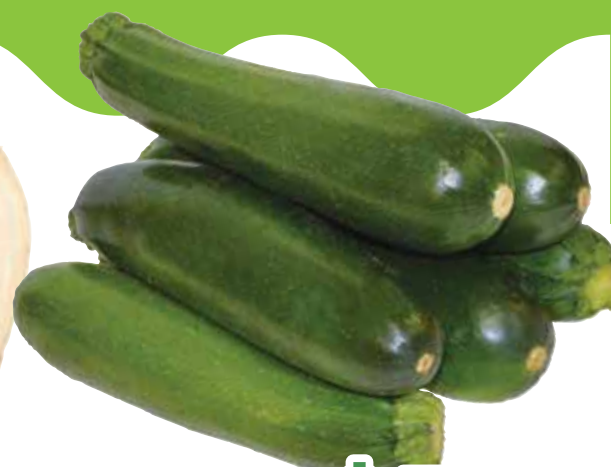
Calabacita Italiana Italian Squash