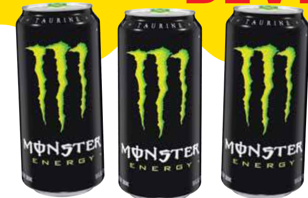
Bebida Energetica Monster Energy Drink 16 oz.