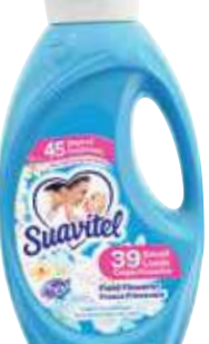
Suavizante Suavitel Selected Varieties Fabric Softener, 46 oz.