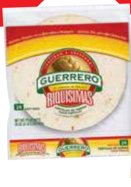
Tortillas de Harina Riquisimas o de Trigo Guerrero Riquisimas, Whole Wheat Flour Tortillas 35 oz.