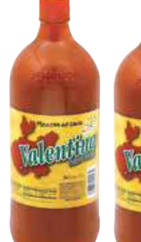
Salsa Picante Valentina Hot Sauce 34 oz. Red Label