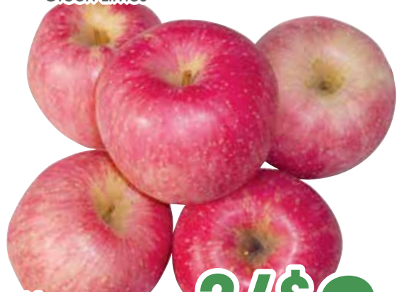
Manzana Fuji Fuji Apples