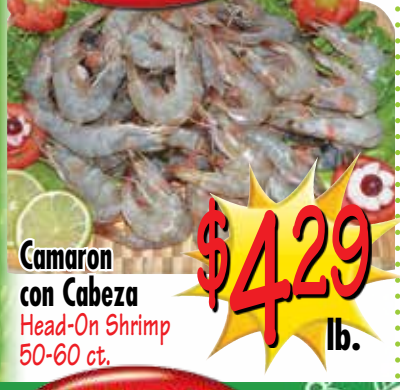
Camaron con Cabeza Head-On Shrimp 50-60 ct.