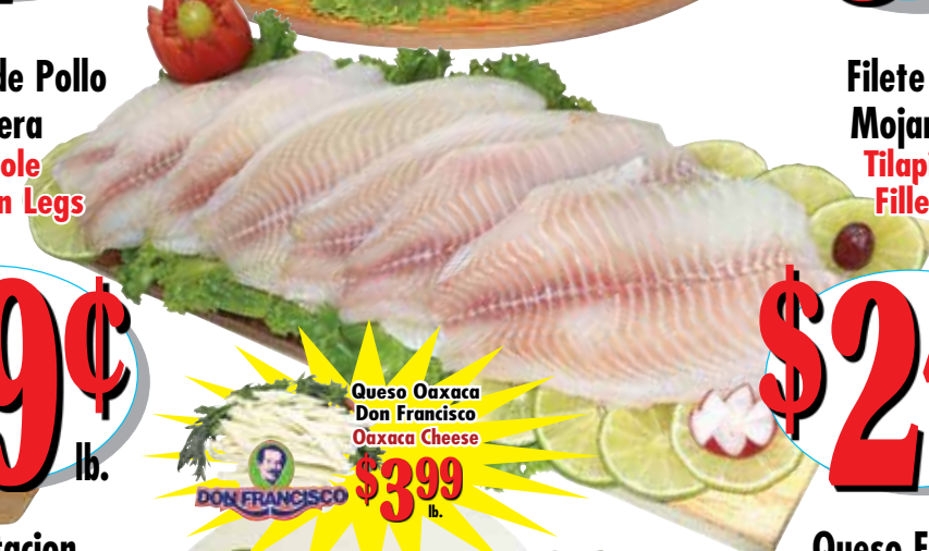
Filete de Mojarra Tilapia Fillet