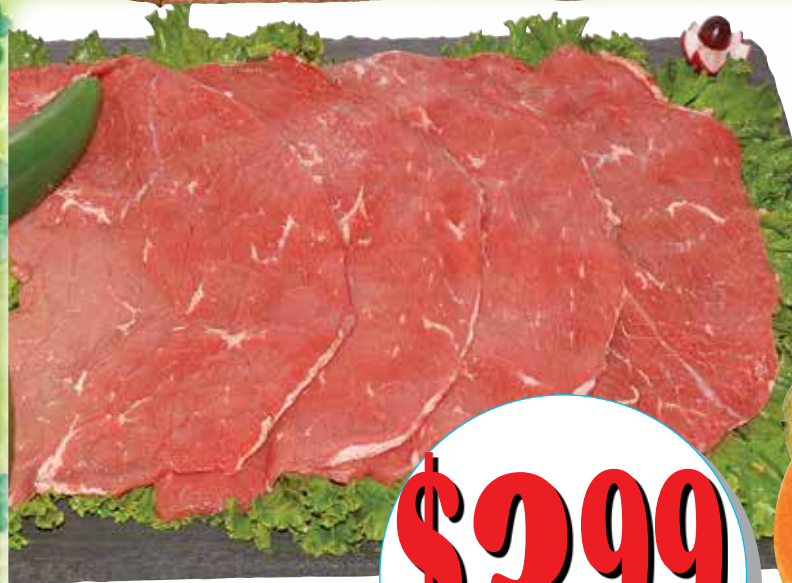
Bistec de Pulpa Negra Inside Round Steak