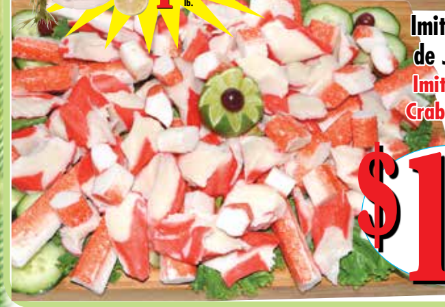
Imitacion de Jaiba Imitation Crab Meat