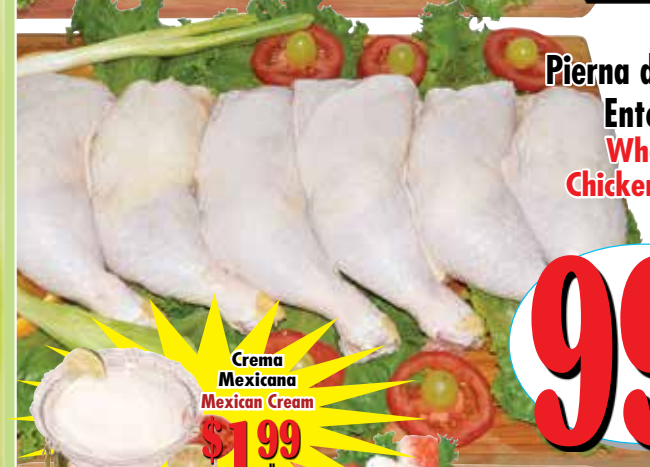
Pierna de Pollo Entera Whole Chicken Legs