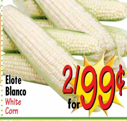
Elote Blanco White Corn