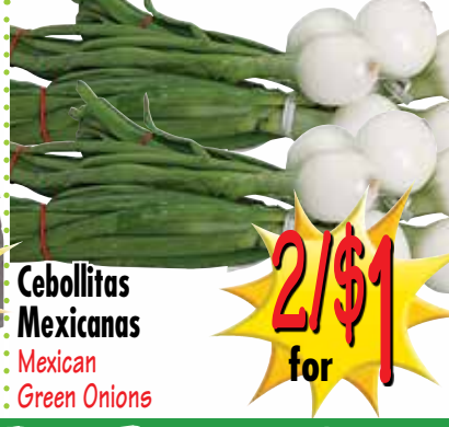
Cebollitas Mexicanas Mexican Green Onions