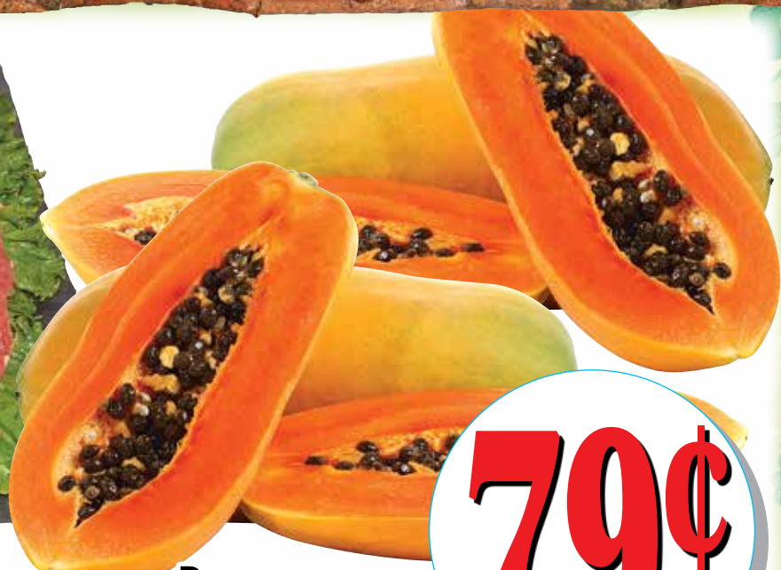
Papaya Dulce Sweet Papaya