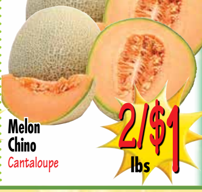
Melon Chino Cantaloupe