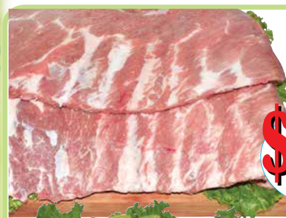
Costillas de Puerco Pork Spare Ribs