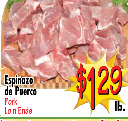
Espinazo de Puerco Pork Loin Ends