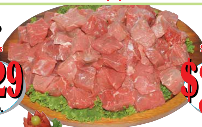
Trocitos de Res Beef Stew Meat