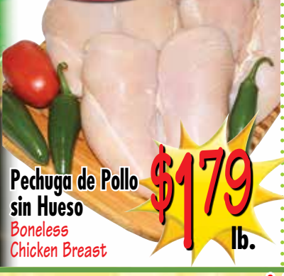
Pechuga de Pollo sin Hueso Boneless Chicken Breast