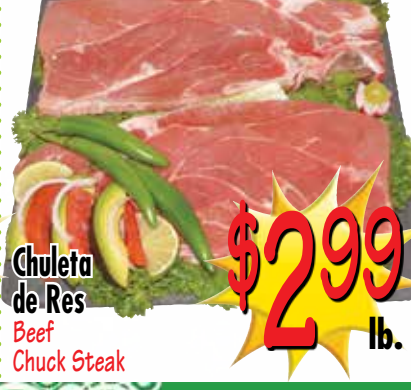
Chuleta de Res Beef Chuck Steak