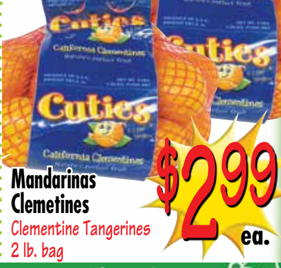
Mandarinas Clementines Clementine Tangerines 2 lb. bag