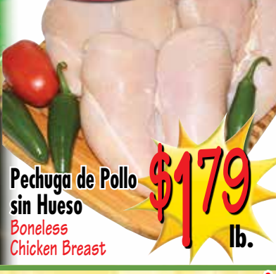
Pechuga de Pollo sin Hueso Boneless Chicken Breast