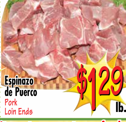
Espinazo de Puerco Pork Loin Ends