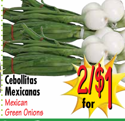
Cebollitas Mexicanas Mexican Green Onions