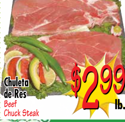
Chuleta de Res Beef Chuck Steak