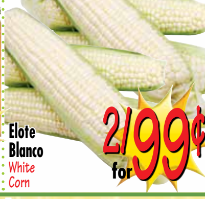
Elote Blanco White Corn